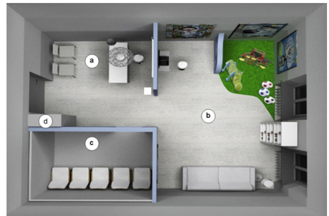
Fig. 1. “Salt Clinic”. 3D design: reception/welcome area (a); waiting room with children's recreation area (b); “Aerosal ® ” halotherapy room (c). ENT Care Unit (d). Cabinet containing the Dry Salt Aerosol Generator – University General Hospital – Bari (Italy).

The room environment is not contaminated with pathogenic microorganisms (as certified by SAS 90 ® measurements). Patients can settle into comfortable chairs inside the room where the dry salt aerosol is blown through a PVC pipe (described below). A centrifugal extractor fan (air flow rate 90 m 3 /h), placed on the side opposite to the PVC pipe ensures a number of complete changes of air in full compliance with requirements in terms of CO 2 ppm values, i.e. <750 ppm. Also temperature and humidity are kept at constant values ranging between 20 °C and 24 °C and 44% and 60%, respectively (TESTO 435-4 ® Digital Multimeter measurements).