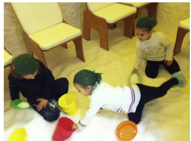
Fig. 2. “Aerosal ® ” Halotherapy Salt Room where children are always highly compliant as they consider treatment sessions as opportunities for play and recreation. ENT Care Unit–University General Hospital – Bari (Italy).

After collection of medical history, all the patients underwent clinical and instrumental exams as follows: ENT visit with inspection of the oropharyngeal tract and tonsillar hypertrophy staging (0°–4°) [27], flexible fibroscope nasal endoscopy (ENT 2000