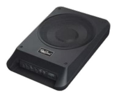
SUB8100 Powered Subwoofer