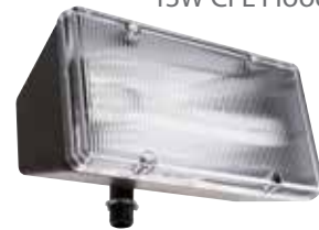
13W CFL Flood