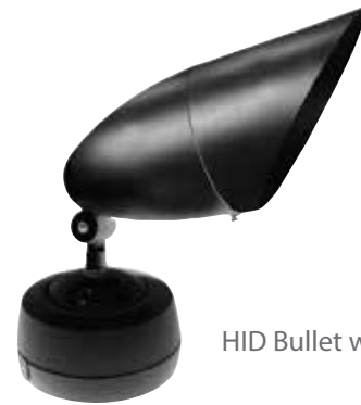
HID Bullet with Visor