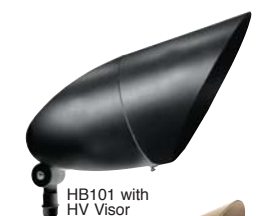
HB101 with HV Visor