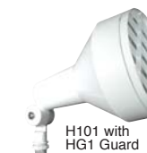
H101 with HG1 Guard