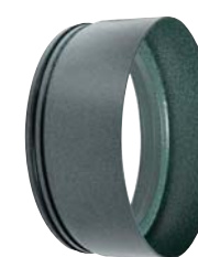
Hood includes glass

Finish: ● Bronze ● Black ○ White ● Verde Green