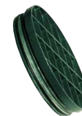
No glass with guard

Finish: ● Bronze ● Black ○ White ● Verde Green