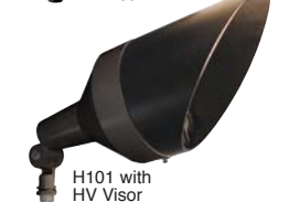
H101 with HV Visor