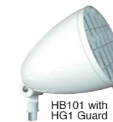
HB101 with HG1 Guard