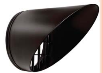
Visor includes glass & guard

Finish: ● Bronze ● Black ○ White ● Verde Green