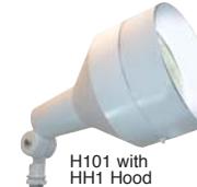
H101 with HH1 Hood