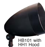
HB101 with HH1 Hood