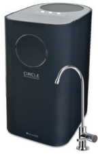
Brondell Circle RC100