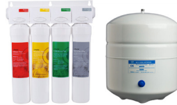
Premier RO-Pure Plus