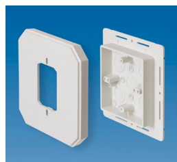
8082F (for 1/2" or less)