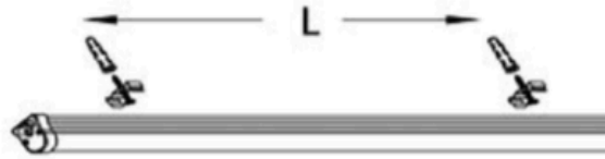
Step1 Fixed the tube to the ceiling

Connection the tube on the wall or on the ceiling: