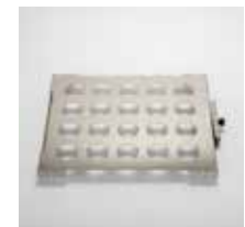
DI-052-A2, Washing Lid 20