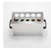
DI-010-A, Rack 10 DI-020-A, Rack 20