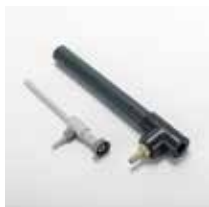
DI-054-A1, Water Jet Pump/Ejector 10 DI-054-A2, Water Jet Pump/Ejector 20