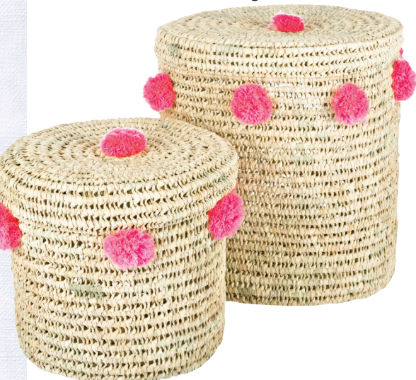
A by Amara Bahia Pom Pom Baskets With Lid, Set of 2, $273, ca.amara.com