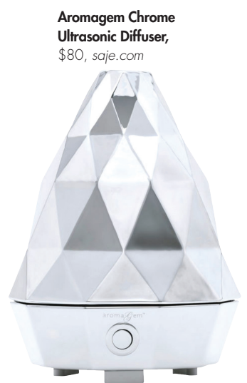
Aromagem Chrome Ultrasonic Diffuser, $80, saje.com