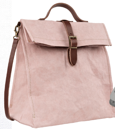
Lunch Bag Long Strap Quarzo, $89, uashmama.ca

For the mom who enjoys cooking, hosting dinner parties, eating good food – or all of the above!