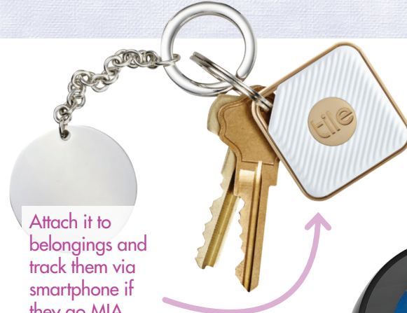
Attach it to belongings and track them via smartphone if they go MIA. Tile Bluetooth Item Tracker, $40, bestbuy.ca