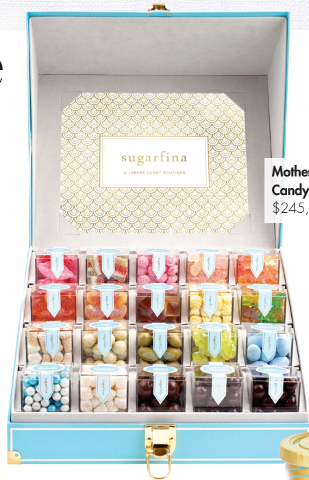
Mother's Day Candy Trunk, $245, sugarfina.ca