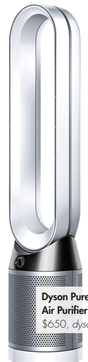
Dyson Pure Cool HEPA Air Purifier and Fan, $650, dysoncanada.ca