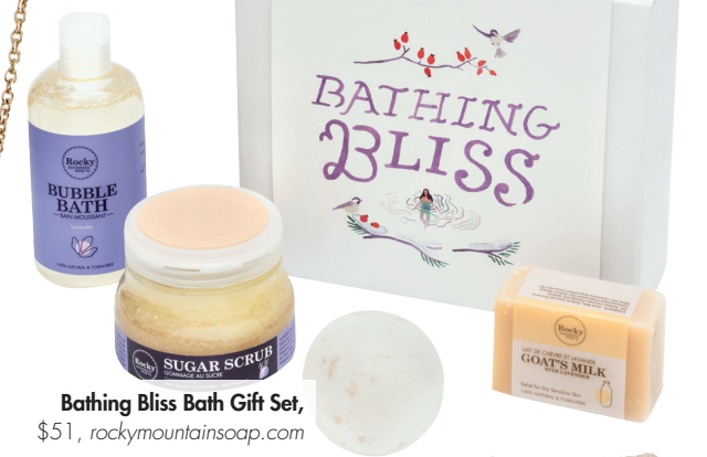
Bathing Bliss Bath Gift Set, $51, rockymountainsoap.com