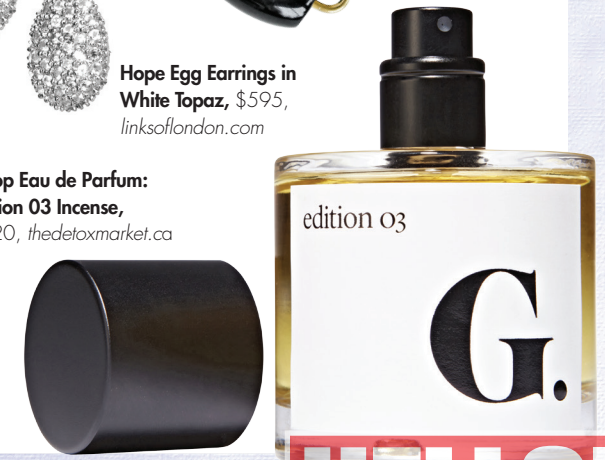
Goop Eau de Parfum: Edition 03 Incense, $220, thedetoxmarket.ca