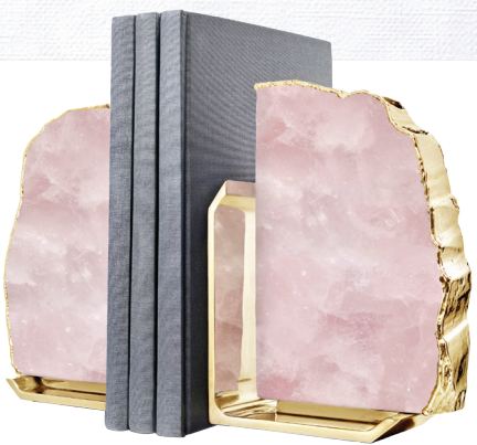
Anna by Rablabs Fim Quartz Bookends, $575, saksfifthavenue.com