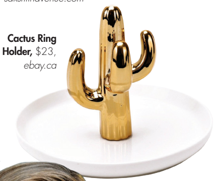
Cactus Ring Holder, $23, ebay.ca