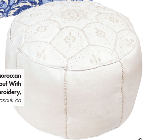
White Moroccan Leather Pouf With Deluxe Embroidery, $120, babasouk.ca

A woman of many talents, Reese Witherspoon runs Draper James, a lifestyle brand that celebrates her southern upbringing with clothing, accessories and home décor.