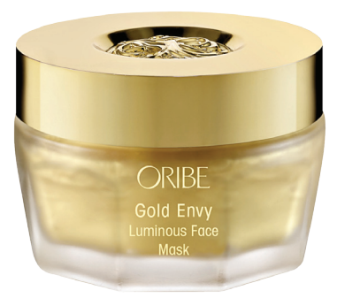
Orbe Gold Envy Luminous Face Mask, $114, holtrenfrew.com