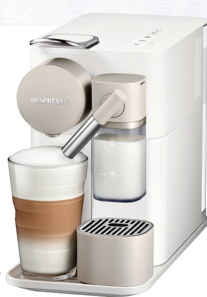
Lattissima One, $449, nespresso.ca