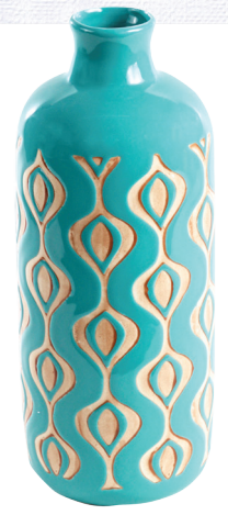
Large Blue Vase, $18, walmart.ca