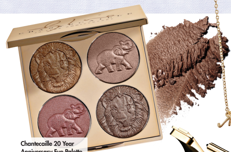
Chantecaille 20 Year Anniversary Eye Palette, $115, holtrenfrew.com (limited edition)