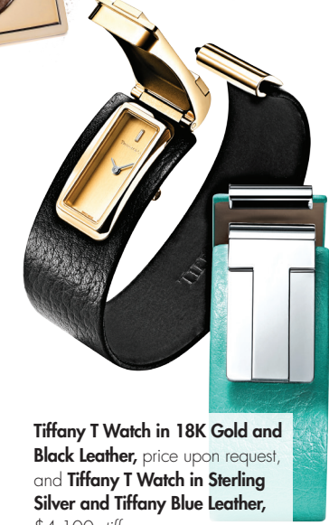
Tiffany T Watch in 18K Gold and Black Leather, price upon request, and Tiffany T Watch in Sterling Silver and Tiffany Blue Leather, $4,100, tiffany.com

No one knows about looking their best better than Jennifer Lopez. Her glow is so coveted the Internet was buzzing when she announced her first makeup collaboration with Inglot!