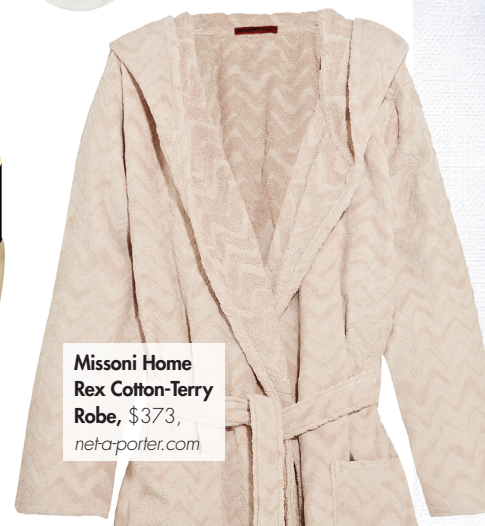
Missoni Home Rex Cotton-Terry Robe, $373, net-a-porter.com