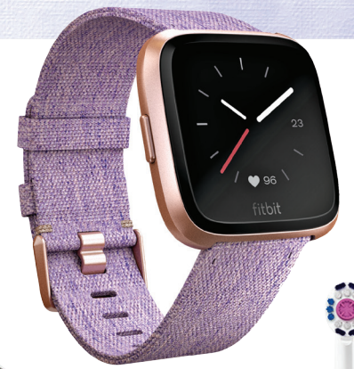
Fitbit Versa, $250, fitbit.com