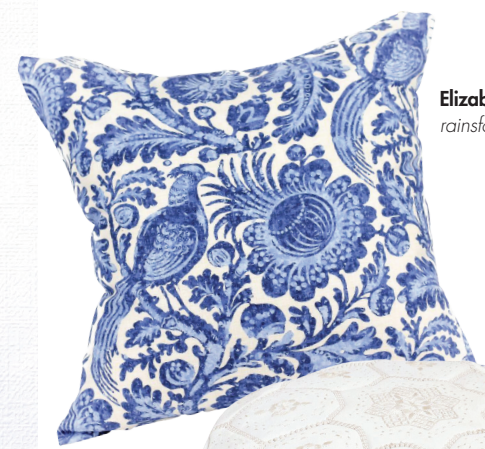
Elizabeth Pillow, $66, rainsfordcompany.com

For the mom who loves stylish home décor and has an enviable eye for interior design