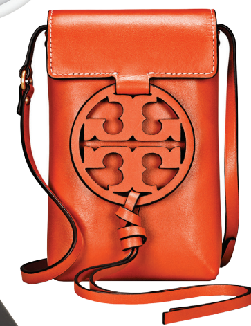
Miller Phone Cross-Body, $268, toryburch.com