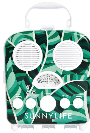
It may look old-school, but this Bluetooth-equipped music player lets you play music from your phone, at the cottage or beach. Sunny Life Banana Palm Beach Sound, $64, shopbop.com