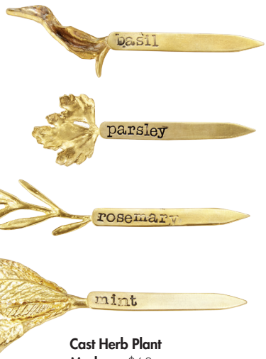
Cast Herb Plant Markers, $63, uncommongoods.com