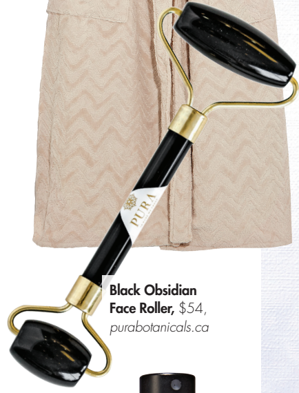
Black Obsidian Face Roller, $54, purabotanicals.ca