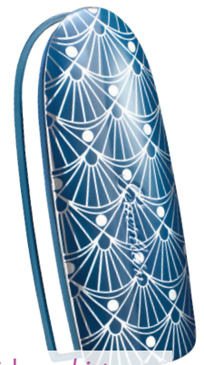
Lipstick or objet d'art? These lipstick cases come in an assortment of swoon-worthy prints. Guerlain My Rouge G Lipstick, $36 for lipstick and $20 for case, guerlain.com

For the woman who appreciates the finer things in life, including a little glitz and glam