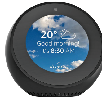
Echo Spot, $170, amazon.ca/echospot