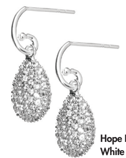
Hope Egg Earrings in White Topaz, $595, linksoflondon.com