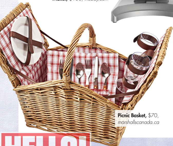
Picnic Basket, $70, marshallscanada.ca