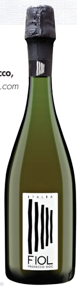
Fiol Prosecco, $16, lcbo.com