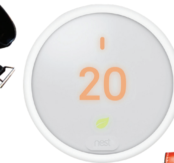
Control the temperature at home from work or while on vacation. Nest Smart Thermostat E, $230, indigo.ca