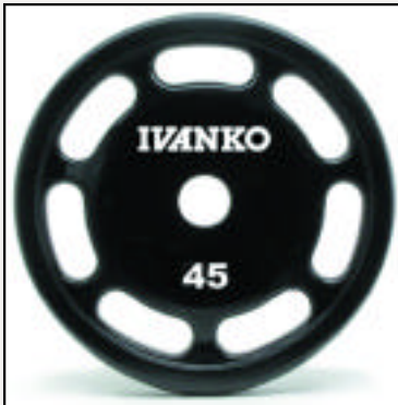
Ivanko's Urethane Olympic Bumper Plate represents the ideal balance between cost considerations, cushioning, and safe handling.

Ideally for a loading plate you need 1/2" on the perimeter edge and 3/8" on the sides, or no less than 3/8" on the perimeter and 1/4" on the sides. Before