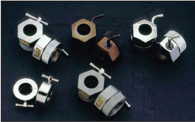
Ivanko's signature hex shaped collar.

This company took our seminal "OM" series Olympic barbell plate and reproduced it verbatim, changing only the name on the plate. That company took our iconic hex-shaped collar (the CO2.5KG) and slapped their name on it. Another copied our revolutionary dumbbell, first introduced in 1981, and still can't get the rubber formula or the actual weight right.