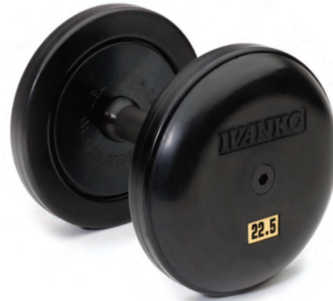
Design 51: Ivanko's seminal fixed rubber dumbbell with trademarked rubber end plate.