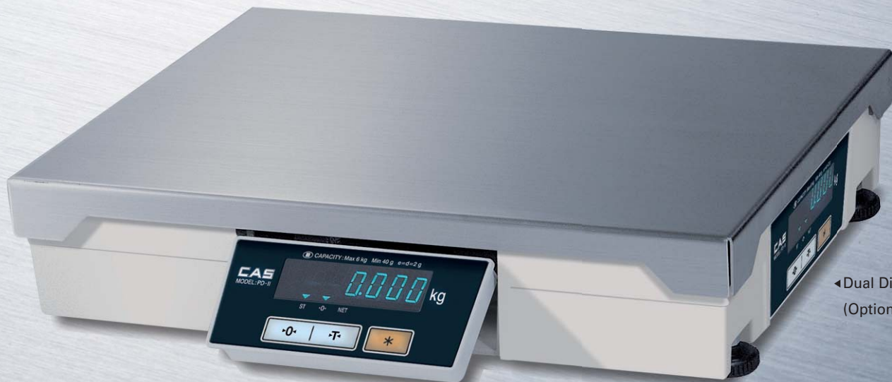
◀ Dual Display (Optional)