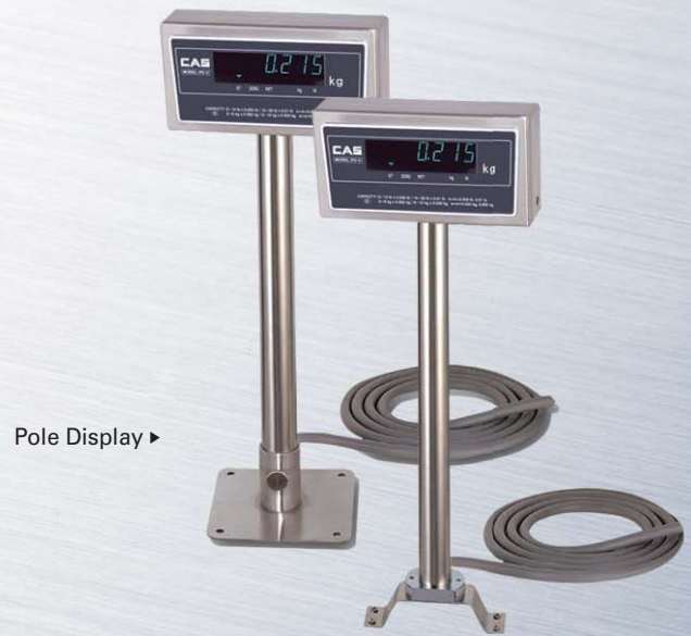
Pole Display ▶