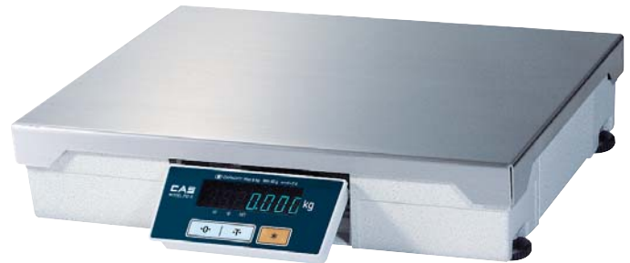
Standard Single Display ▲