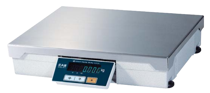
Standard Single Display A