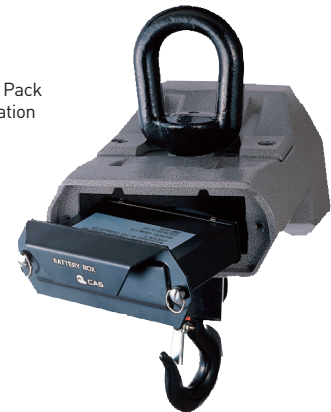
Battery Pack Installation