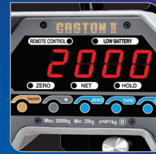
1.2" LED display