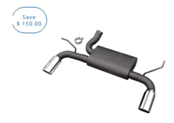
2007-'17 Jeep Wrangler V6 Axle Back* Exhaust — $ 299.99 SKU: LEX4160

We have developed Jeep Wrangler exhaust components perfectly tuned to generate excellent tone and power. Our Jeep Wrangler exhausts can fit for year 2015, 2014, 2013, and 2012. Formed from high-grade stainless steel, our products are backed with a <u>limited lifetime warranty</u> making Legato Performance the last exhaust system your car or truck will ever need.