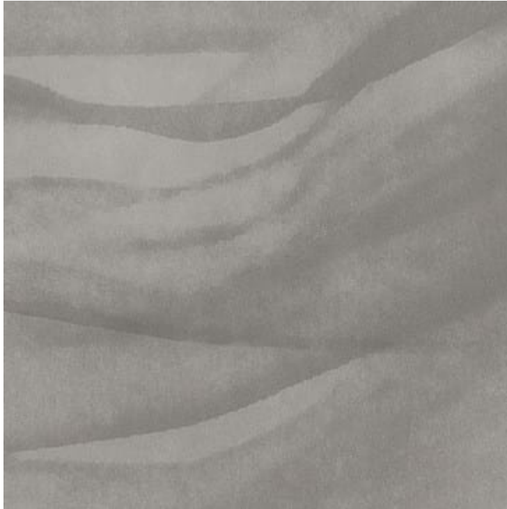
Fig1 Image of product