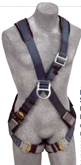
1108682 EXOFIT™ CROSS-OVER STYLE HARNESS Front and back D-rings, loops for belt, quickconnect buckles. (XLarge) 1108675 Small 1108676 Medium 1108677 Large

A front-mounted D-ring makes the cross-over style ideal for ladder climbing and rescue applications.