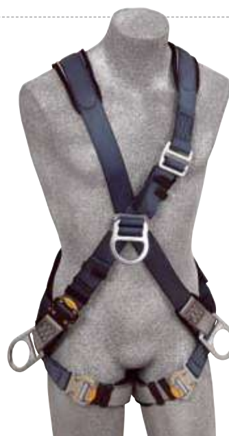
1108706 EXOFIT™ CROSS-OVER STYLE HARNESS Front, back and side D-rings, loops for belt, quick connect buckles. (XLarge) 1108700 Small 1108701 Medium 1108702 Large