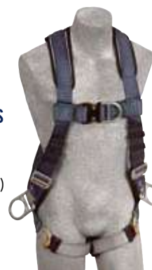
1108606 EXOFIT™ VEST-STYLE HARNESS Front, back and side D-rings, loops for belt, quick connect buckles. (XLarge) 1108600 Small 1108601 Medium 1108602 Large