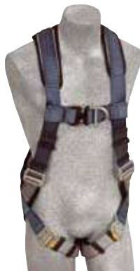
1108532 EXOFIT™ VEST-STYLE HARNESS Front and back D-rings, loops for belt, quick connect buckles. (XLarge) 1108525 Small 1108526 Medium 1108527 Large