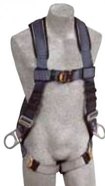
1108581 EXOFIT™ VEST-STYLE HARNESS Back and side D-rings, loops for belt, quick connect buckles. (XLarge) 1108575 Small 1108576 Medium 1108577 Large