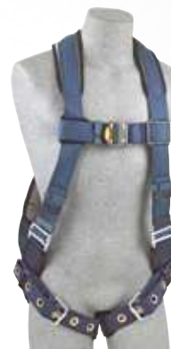
1109358 EXOFIT™ VEST-STYLE HARNESS Back D-ring, loops for belt, tongue buckle legs. (XLarge) 1109355 Small 1109356 Medium 1109357 Large