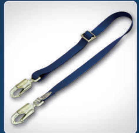
1234030 Adjustable Web Positioning Strap