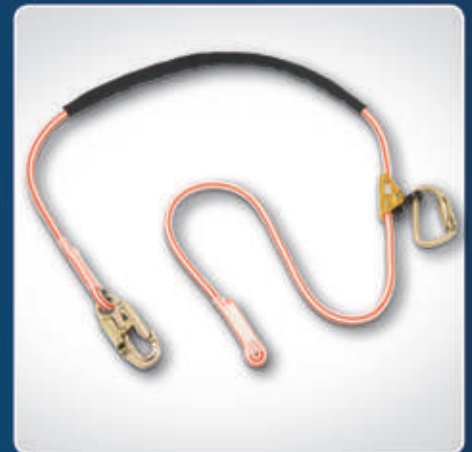
1234070 Adjustable Rope Positioning Strap (Meets OSHA 1910.268(g), 1926.502(e), & 1926.959)