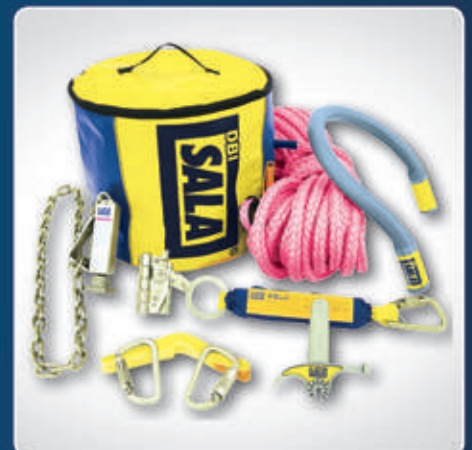
2104800 SafLok™ Pole Anchor System Meets ANSI Standards—USA