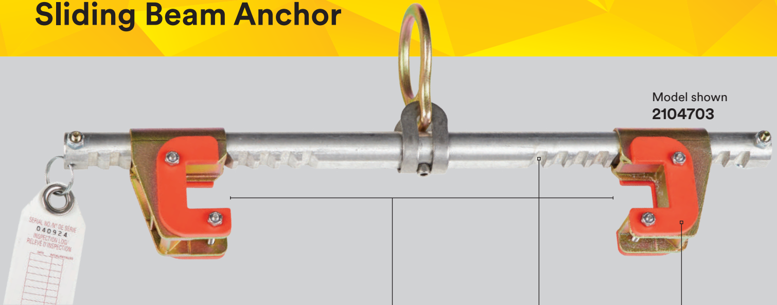
Model shown 2104703