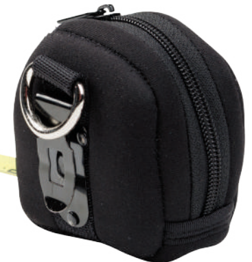
#1500165 Large Tape Measure Sleeve (For most up to 35 ft.)