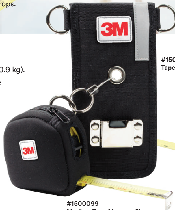
#1500098 Tape Measure Retractor Holster