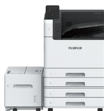
With 2 Tray Module and High Capacity Feeder B1