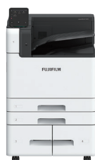
With Tandem Tray Module