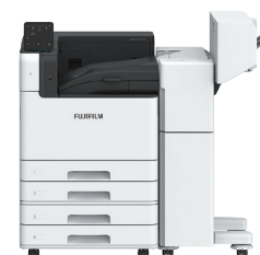
With 2 Tray Module, Finisher-B4 / B5, Booklet Maker Unit and Hole Punch Kit