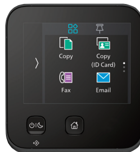
2.8-inch colour touch panel