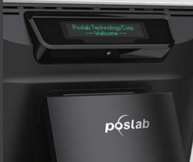
High Brightness VFD Display