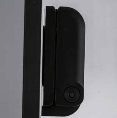
MSR & i Button