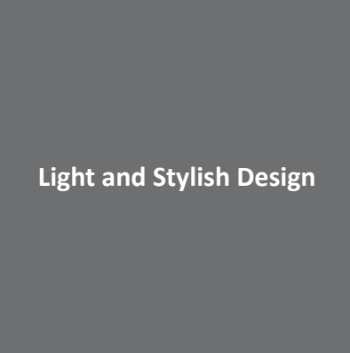
Light and Stylish Design