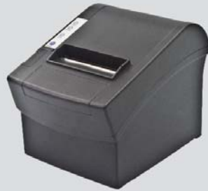
Support Thermal Printer.