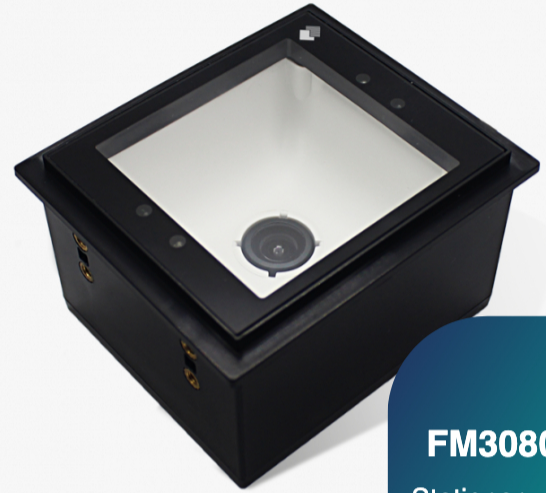
FM3080 Hind Stationary Scanners