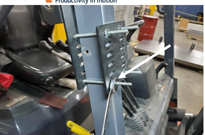
Determine mounting height on post. Add backing plate and hardware.