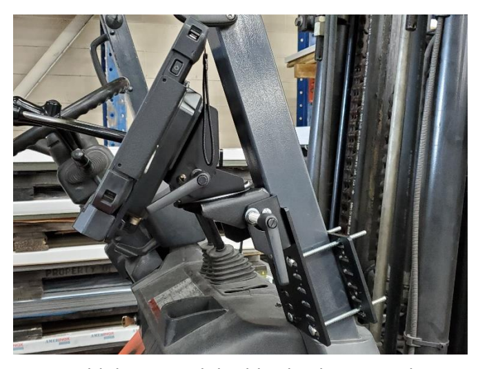
Add device and double check a control accessibility. Adjust as needed.