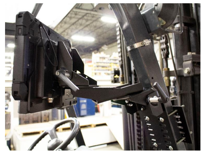
Repeat above process for MH-1012.

For additional strength, lock handle may be removed and a permanent bolt and nut combination installed.