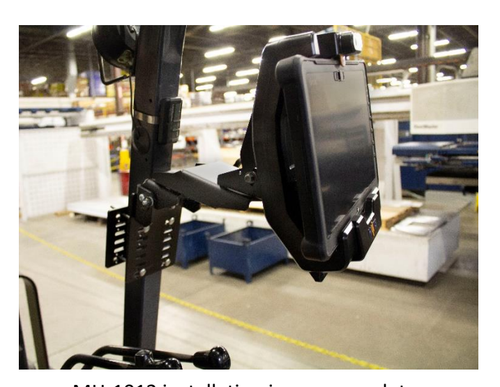
MH-1012 installation is now complete.

For additional strength, lock handle may be removed and a permanent bolt and nut combination installed.