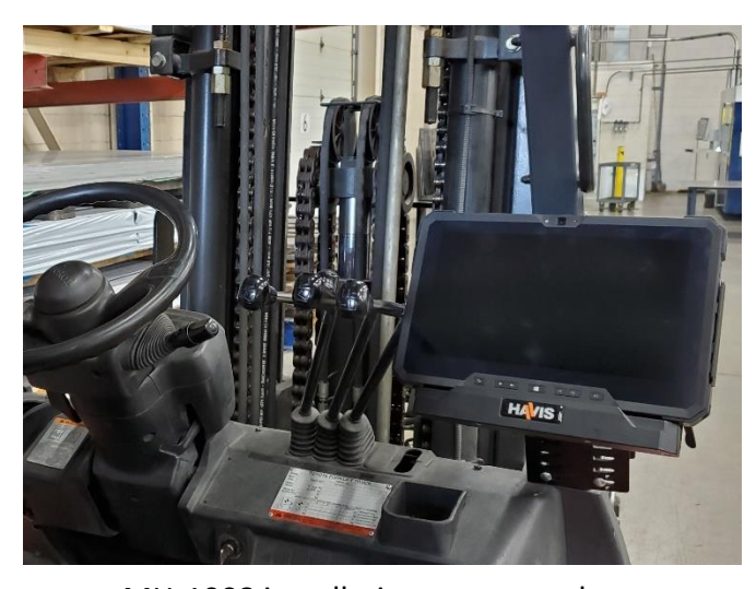
MH-1008 installation now complete.