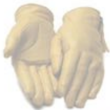
5 Timberland Leather Work Gloves timberland.com