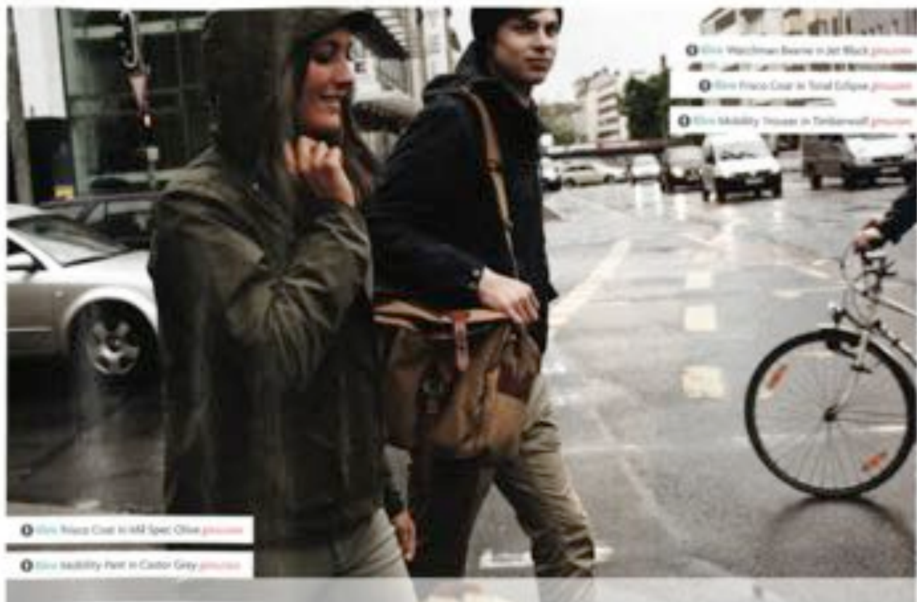
1 Olive Warfare Coat in M Spec Olive jcrew.com

From the morning ride to work to the weekend getaway, these great pieces are big on seasonal style with functional features galore.