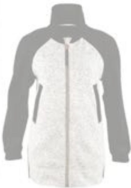
2 Patagonia Soft-Shell Bomber Jacket patagonia.com