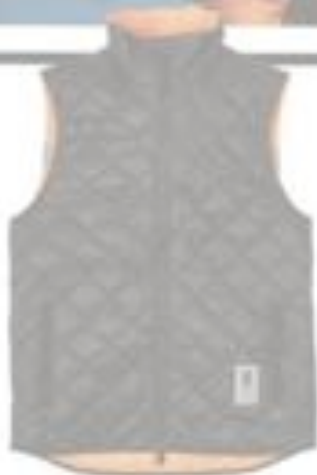
3 Patagonia Warm Wind patagonia.com