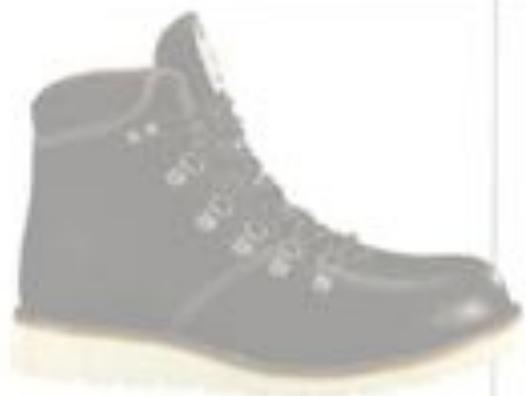
6 Timberland Stone Island timberland.com