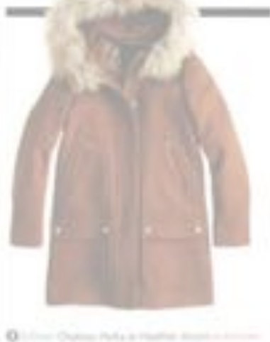
7 Olive Chelsea Parka in Heather jcrew.com