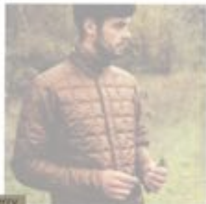
8 Patagonia Down Jacket patagonia.com