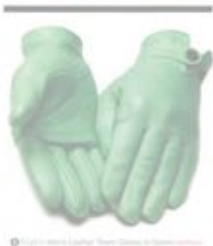
8 Olive Work Leather Work Gloves in Timberwolf jcrew.com