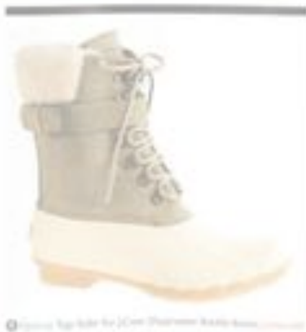
6 Olive Top Side for J Crew (Performance Beanie) jcrew.com