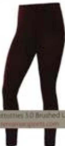
7 Timberland Hottolites 3.0 Brushed Legging in Berry timberland.com