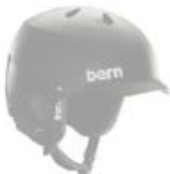
4 Bern Wings 2.0 Helmet (Black with Berry Carbon) bern.com