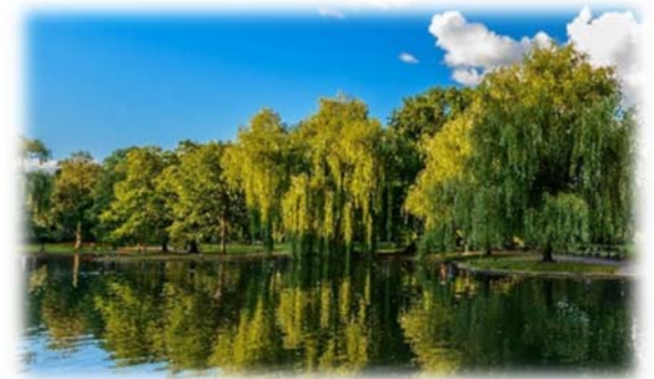
Willows of the Stream