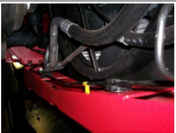
Step 10. Install Lines

A. Install the brake lines into the retainers on the crossmember. On V8 Models, install the A/C line retainer on the stud using the factory nut.