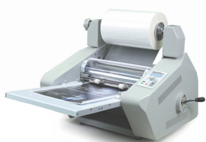
ENTRY LEVEL Excelltop-380