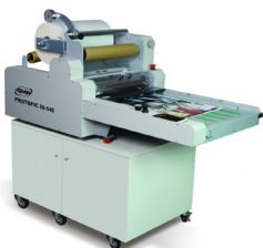
INDUSTRIAL Protopic Range