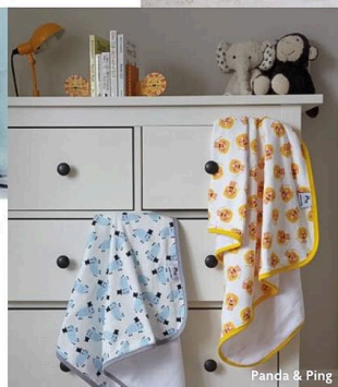
Panda & Ping