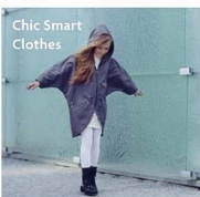
Chic Smart Clothes