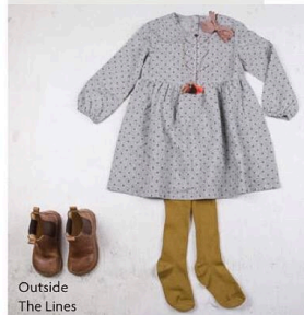
Outside The Lines