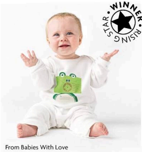
From Babies With Love