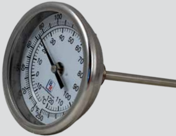
Model BR3 3" Dial Bi-Metal Thermometer