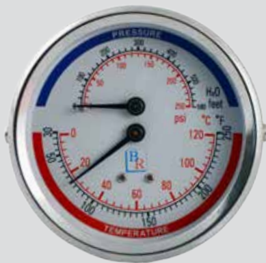
Model BRPT Boiler Gauge / Tridicator