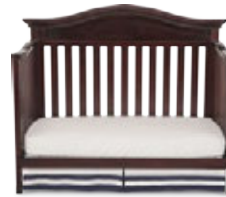
E (Shown with Daybed/Toddler Guardrail #180126 - Sold Separately) Daybed Conversion