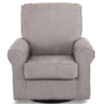
C Upholstered Glider