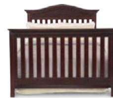
D (Full Size Bed Rails #180080 - Sold Separately) Full Size Bed Conversion