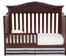
E (Shown with Daybed/Toddler Guardrail #180126 - Sold Separately) Toddler Bed Conversion