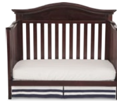
E (Shown with Daybed/Toddler Guardrail #180126 - Sold Separately) Daybed Conversion