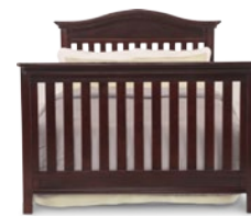
D (Full Size Bed Rails #180080 - Sold Separately) Full Size Bed Conversion