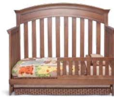
F (Shown with Daybed/Toddler Guardrail Kit #180126 - Sold Separately)