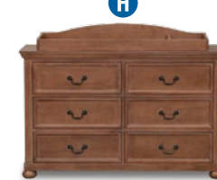
(Changing Top #180530 - Sold Separately)