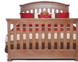
G (Full Size Bed Rails #180080 - Sold Separately)