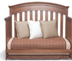
(Shown with Daybed/Toddler Guardrail Kit #180126 - Sold Separately)