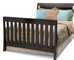
L (Full Size Bed Rails #0050 - Sold Separately)