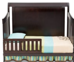
K (Shown with Toddler Guardrail #180125 - Sold Separately)