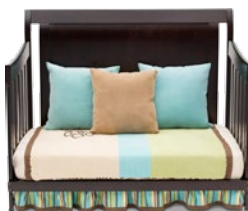
(Daybed Rail Included)