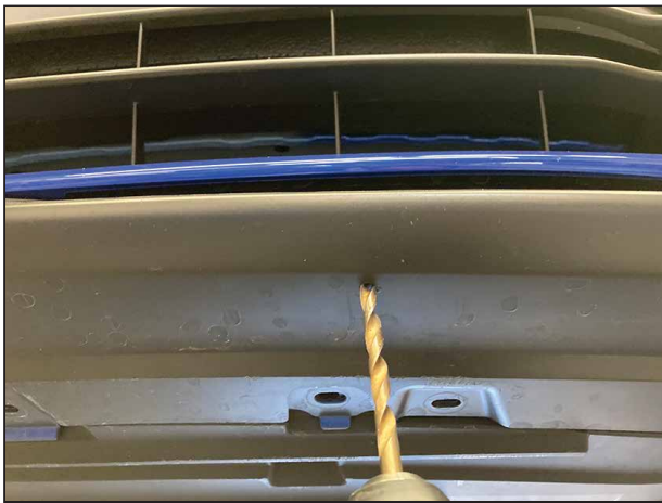
Drill out the holes.