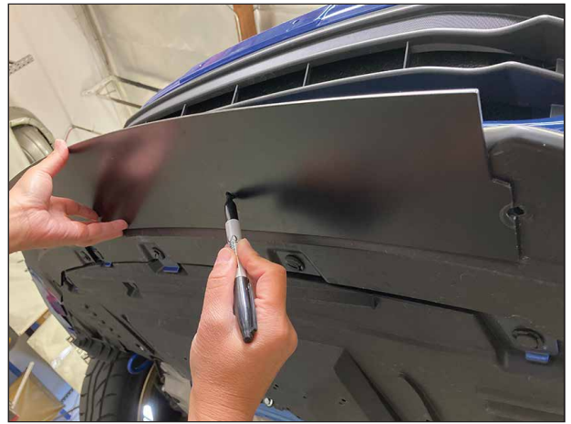
Hold up the center piece against the bumper and mark the (2) middle holes for drilling.