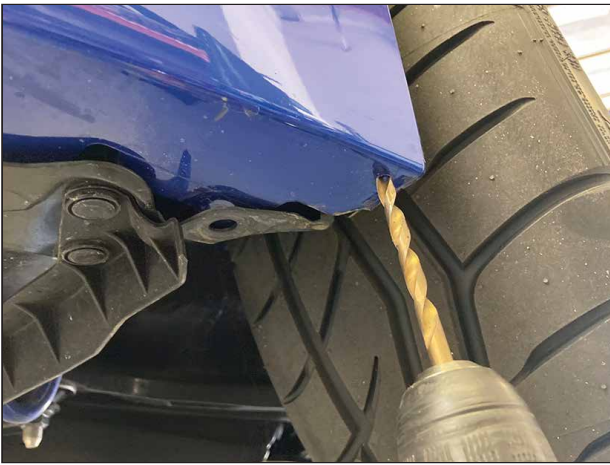
Drill out the hole.