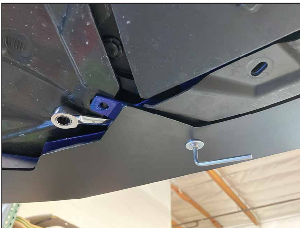
Attach one side piece using (1) 1/4"-20 Buttonhead Bolt, (2) 1/4" USS Flat Washer, (1) 1/4" Split Lock Washer, and (1) 1/4"-20 Hex Nut on the center mounting hole. (Note: the splitter and bumper are sandwiched between the (2) USS Flat Washers)