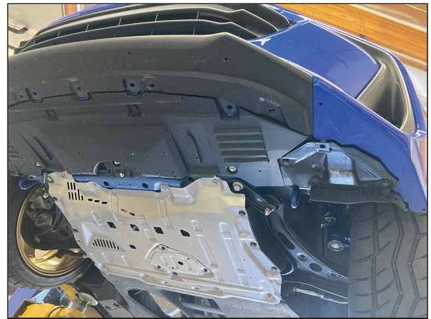
The bumper should look like the image above with the new holes.