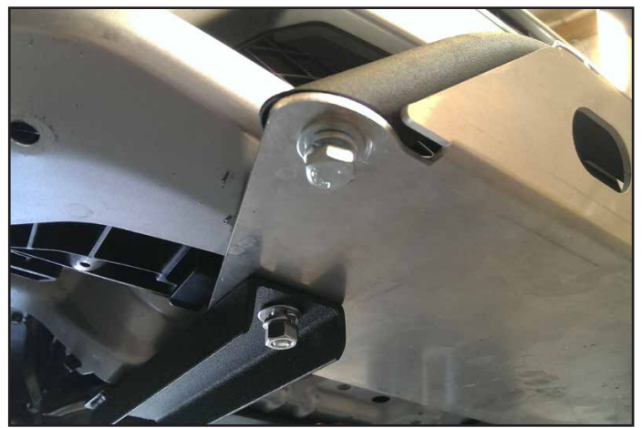
Fasten Ultimate Light Bar to Skid Guard with (2) 3/8" x .75" Hex Bolts, (2) Lock Washers, and (2) Flat Washers.