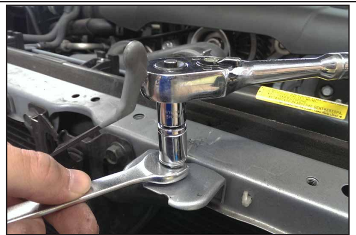
Attach (2) Rivnuts to each of the metal tabs on the upper radiator support. Use a 9/16" Wrench to hold the nut while tightening with a 7/16" Wrench or Socket.