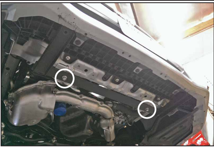
Fasten the Lower Mounting Brace to the Bolt Plates using (2) 3/8" Hex Nuts, Lock Washers, and Flat Washers. Cut and reattach splash guard. See below for cutting instructions