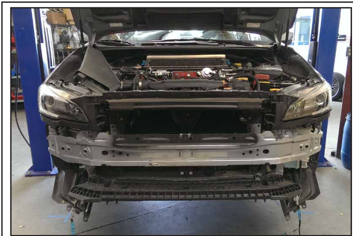
Remove front bumper cover and splash guard.