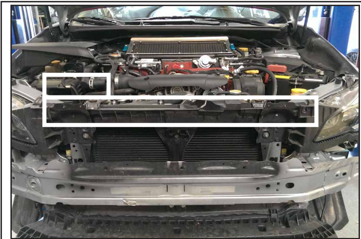
Remove the top plastic piece and intake snorkel.