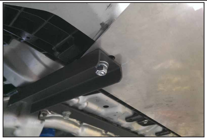
Slide the Skid Guard between the brace and bumper cover. Fasten with (1) 3/8" x 1" Hex Bolt, (2) Flat Washers, (1) Lock Washer, and (1) Hex Nut per side.