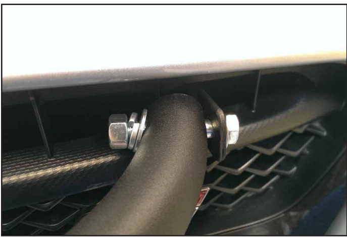
Attach Ultimate Light Bar to the Upper Tubes and fasten with (1) 3/8" x 2" Hex Bolt, (2) Flat Washers, (1) Lock Washer, and (1) Hex Nut per side.

Note: May need to apply pressure to Tubes to fit.