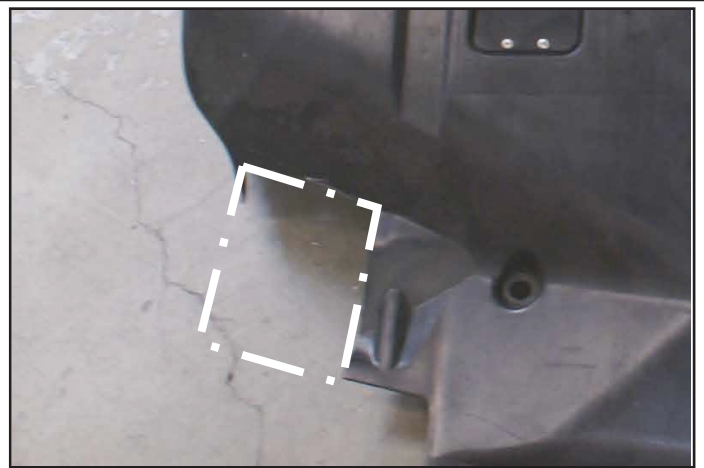
For STI: Cut the splash guard as shown and reattach prior to/above Skid Guard.