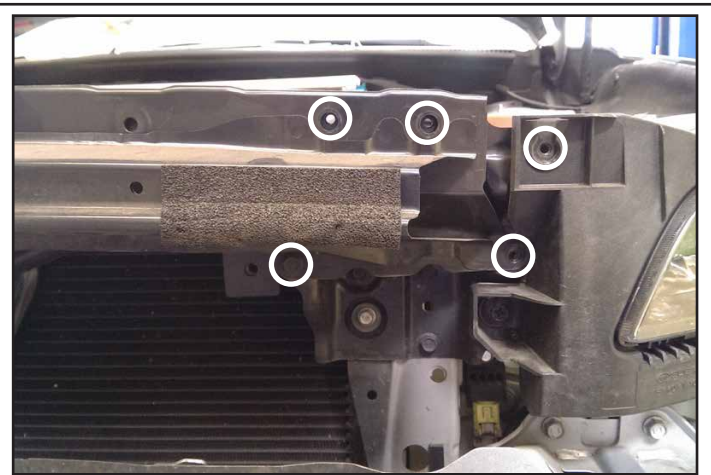
Remove the upper bumper beam by removing indicated bolts.