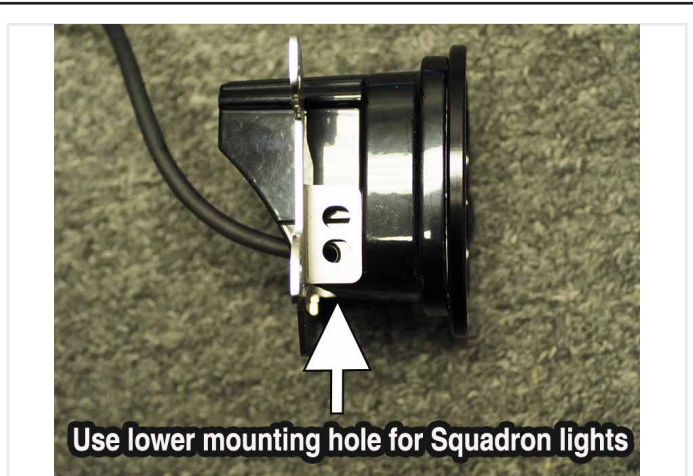
Attach new foglight to Light Conversion Bracket like shown above. Repeat on passenger side.