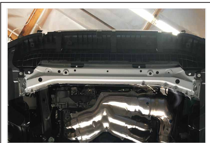
Remove splash guard.

Note: Removal of front bumper cover is optional, but may be easier for installation of lights.