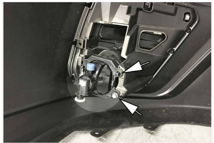
Remove fender plastic rivets to allow access behind the foglights. Unplug the foglight harness and undo the plastic screw and M6 bolt shown above (keep for later).