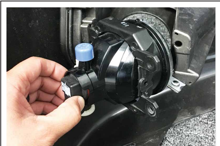
Remove factory foglight from bumper cover.