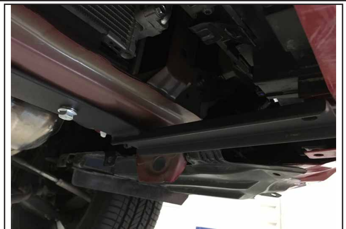
Install the mounting brace, using (1) M8 bolt, (1) 5/16 lock washer, and (1) 5/16 washer, per side. Tighten to 15 lb-ft.