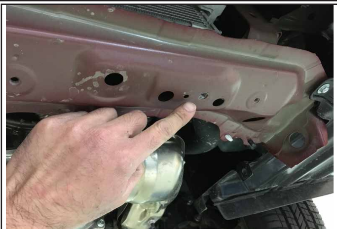
Identify the two mounting points to install the mounting brace.