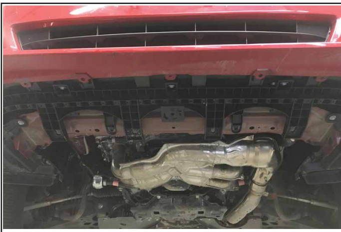
Remove the splash guard.