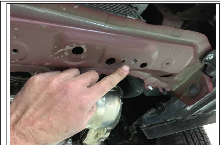
Identify the two mounting points to install the mounting brace.