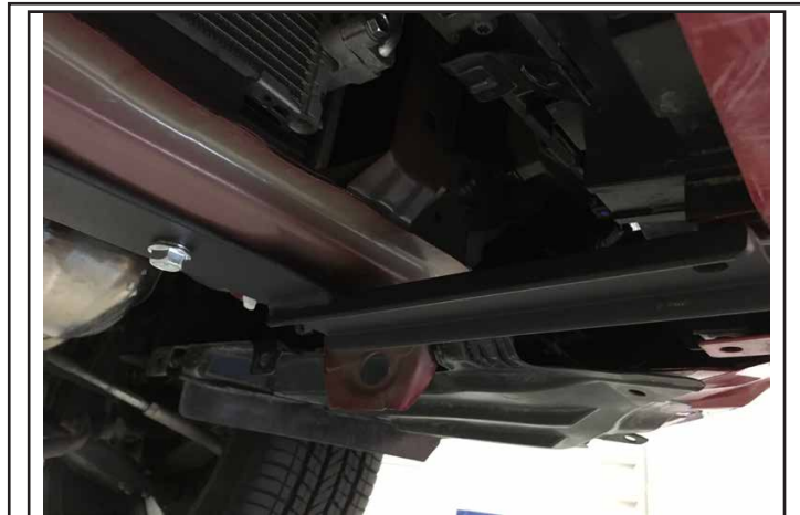
Install the mounting brace, using (1) M8 bolt, (1) 5/16 lock washer, and (1) 5/16 washer, per side. Tighten to 15 lb-ft.