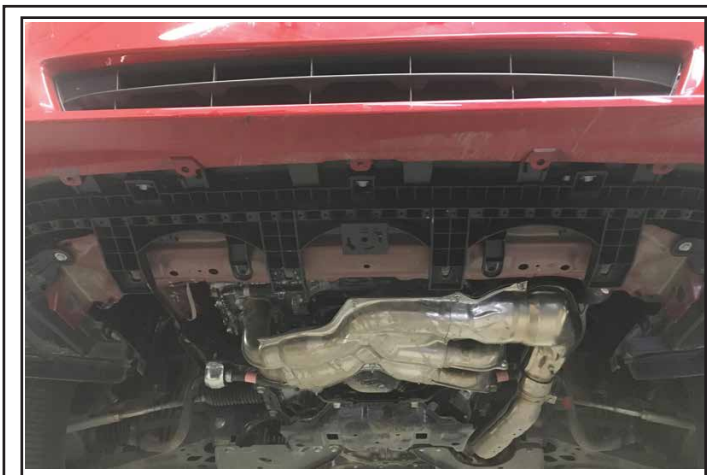
Remove the splash guard.