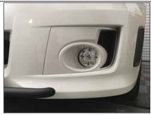
Re-attach fog cover and adjust light positioning as necessary. Wire the lights and re-attach the side vent covers.