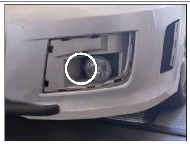
Remove the (2) Phillips screws on the inner side of the fog light.