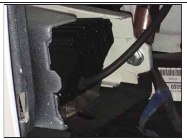
Attach the Baja Design Squadrons to the Mounting Brackets. Slide the lights all the way forward and tighten the hardware.