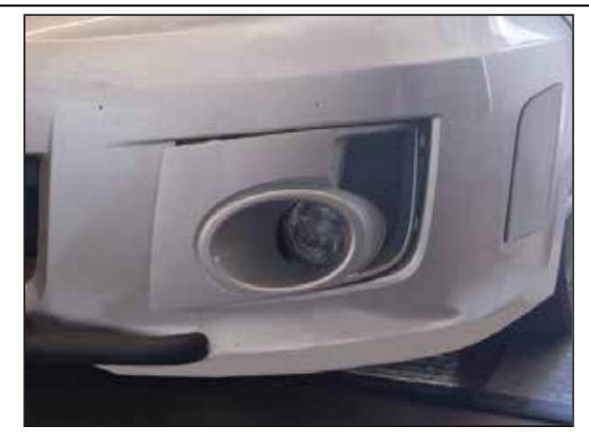
Carefully remove the side vent and fog light covers.