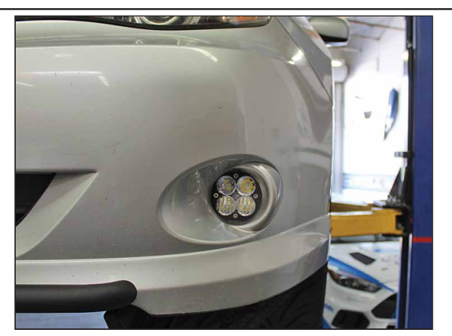
Confirm the position of the light in the bumper fog light hole is center and tighten all hardware. Repeat the process on the passenger side.

The driver side assembly mounts as shown. Insert (1) 3/8"-16 x 1" Hex Bolt and (1) 3/8" Flat Washer through the fog light bracket and bumper mounting tab. Then fasten with 3/8" Flat Washer, Split Lock Washer and Hex Nut.