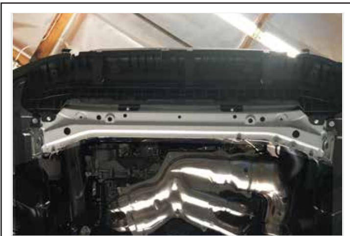
Remove splash guard.

Note: Removal of front bumper cover is optional, but may be easier for installation of lights.