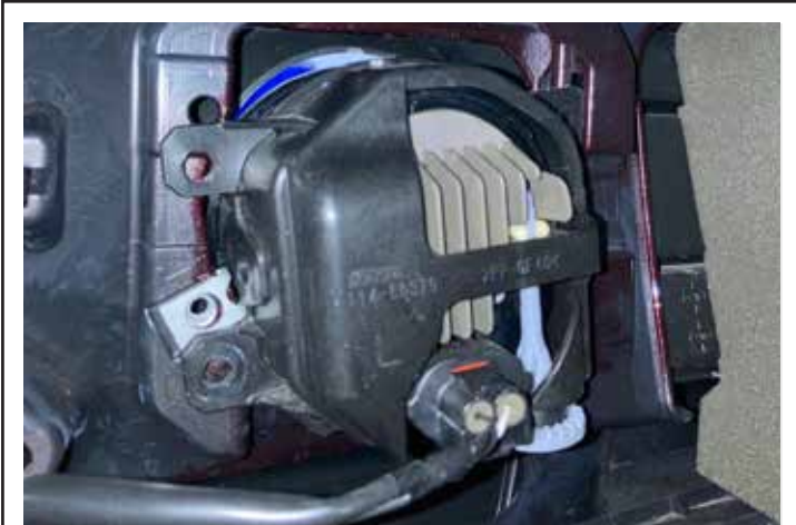
Remove factory foglight from bumper cover.