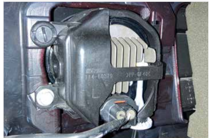
Remove fender plastic rivets to allow access behind the foglights. Unplug the foglight harness and undo the plastic screw and M6 bolt shown above (keep for later).