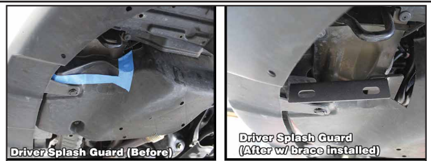
Driver Splash Guard (Before)