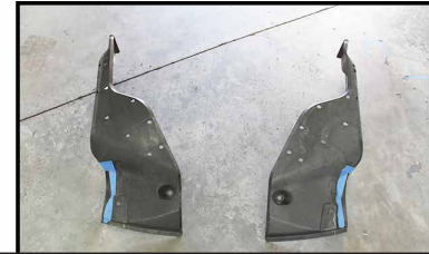
Driver Splash Guard (After w/ brace installed)

To use splash guard, cut the area around the tape shown to have clearance of the mounting hardware. Repeat trimming on passenger side splash guard. (2008-2009 2.5i PZEV non-turbo shown).