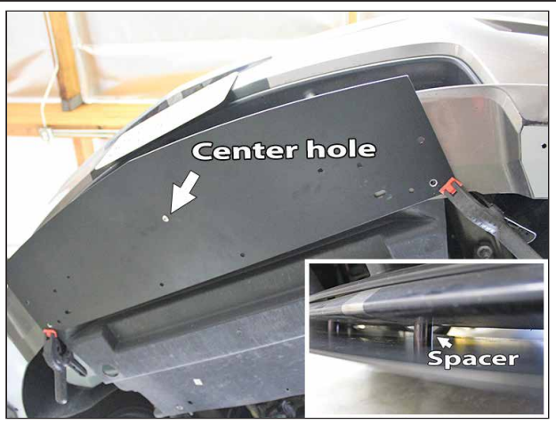
Place (1) Spacer on top of the center hole on the center splitter. Fasten the splitter loosely to the bumper using the supplied hardware in the following orientation: (1) 1/4"-20x1.5" Buttonhead Bolt > Splitter > Spacer > 1/4" Flat Washer, 1/4" Lock Washer, and 1/4" Hex Nut.