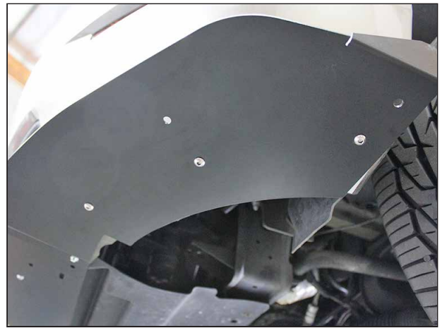
Loosely fasten the side pieces to the bumper using hardware in the following orientation: (1) 1/4"-20x1" Buttonhead Bolt > Splitter > 1/4" Flat Washer, 1/4" Lock Washer, and 1/4" Hex Nut. Do not tighten yet.