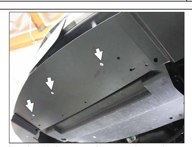
Tighten the (3) bolts securing the center splitter to the bumper using a 5/32 hex key and 7/16" wrench.