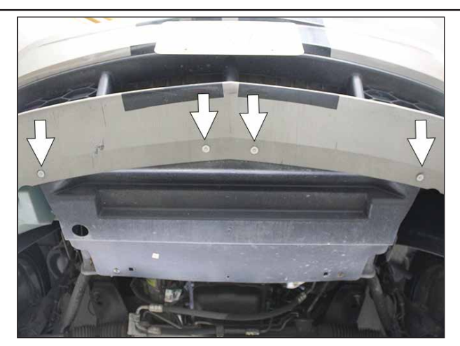
Remove the 4 screws holding the splash guard to the front bumper.