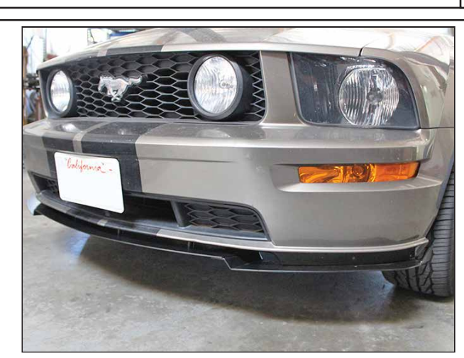
Completed assembly shown.