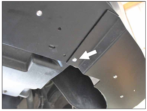
Fasten (1) #8 x 1.5" Screw and (1) #8 Flat Washer to the factory j-clip on the splash guard, securing the splitter pieces together with the bumper.