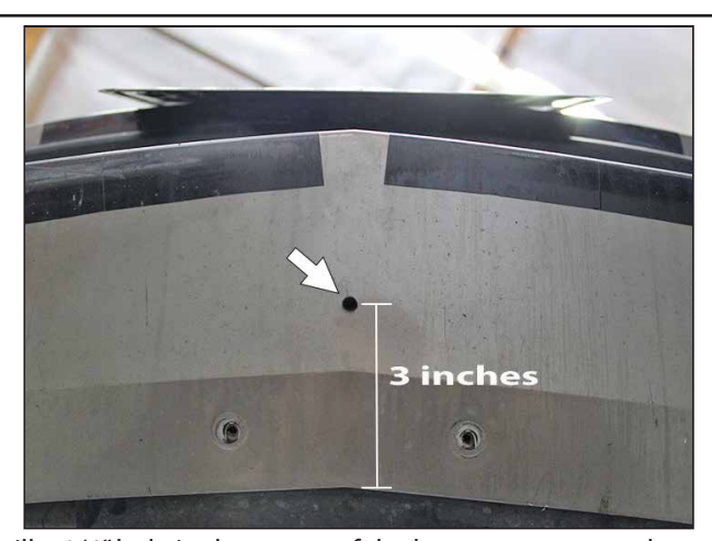
Drill a 1/4" hole in the center of the bumper to mount the center splitter. The hole should be located 3" from the rear edge.