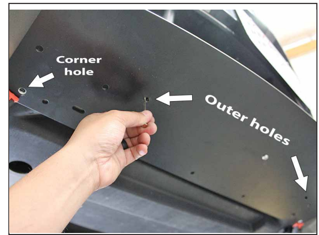
Line up the corner holes with the factory mounting holes in the bumper. Mark the two outer holes for drilling. Drill out holes to 1/4". Fasten the new holes with hardware in the following orientation: (1) 1/4"-20x1.5" Buttonhead Bolt > Splitter > Spacer > 1/4" Flat Washer, 1/4" Lock Washer, and 1/4" Hex Nut.