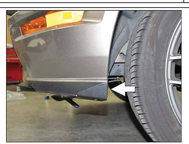
Hold the splitter against the bumper, align the holes with the template and check that the fin on the splitter is collinear with the rear bumper edge. If not, readjust and mark holes. Drill holes out to 1/4". Repeat on passenger side.