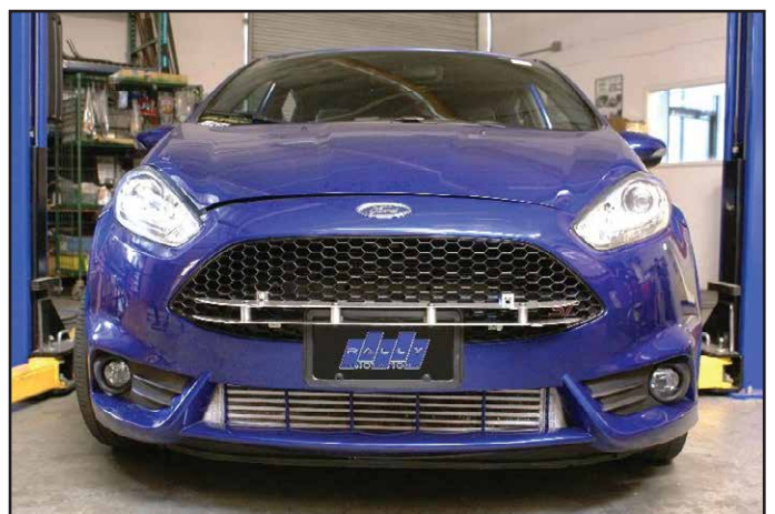
Reinstall front bumper cover and headlights. Recommend mounting and wiring lights prior to re-installation.