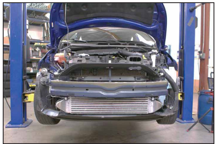
Remove front bumper cover.