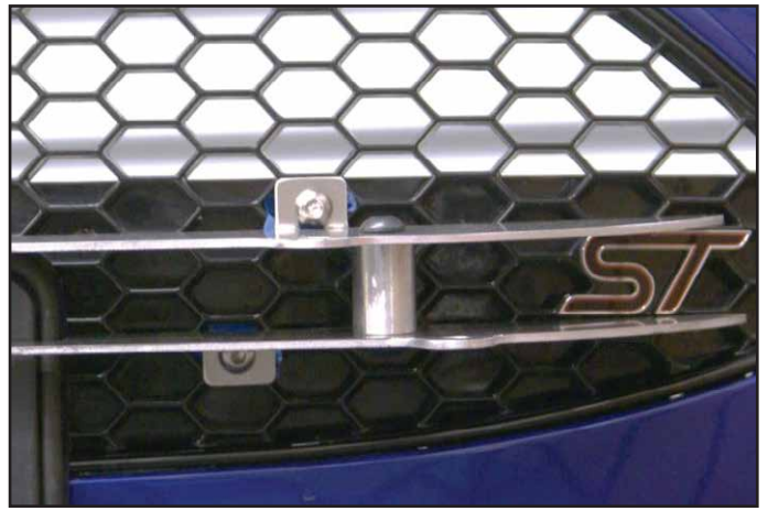
Insert 5/16" Buttonhead Screws through tabs and grill.