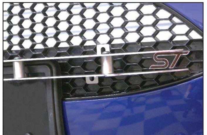
Align light plate to grill and double-check marked hexes. NOTE: ST badge should sit between the plates.