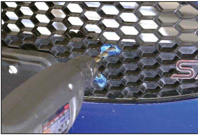
Drill through grill with 3/8" Drill Bit.