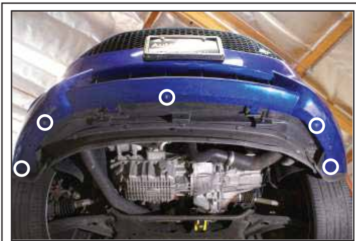
Remove indicated OEM splash guard screws.