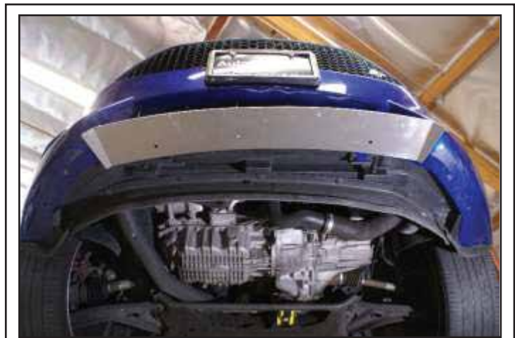
Loosely fasten center piece with OEM hardware.