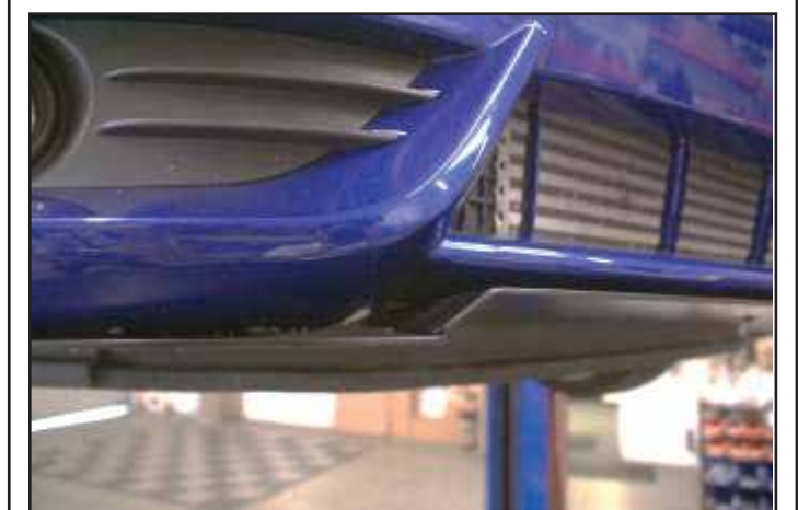
Check fitment and tighten hardware. NOTE: Center piece rests on TOP of side pieces.