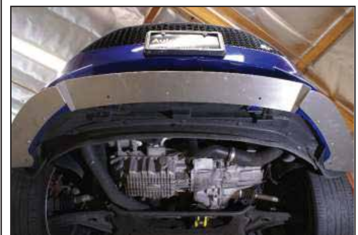
Loosely fasten side pieces with OEM hardware. Remove/loosen fender liner to gain access for rearmost hardware.