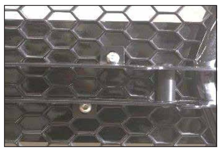
Insert 5/16" Buttonhead Screws through tabs and grill.