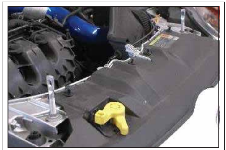
Detach hood release cable and remove front bumper.