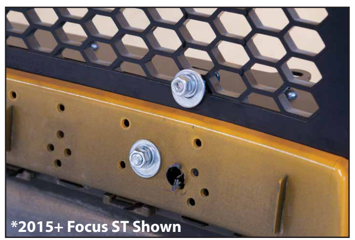
Fasten with 1/2" Flat Washer, 5/16" Flat Washer, 5/16" Lock Washer, and 5/16" Hex Nut on each bolt. Tighten all hardware.