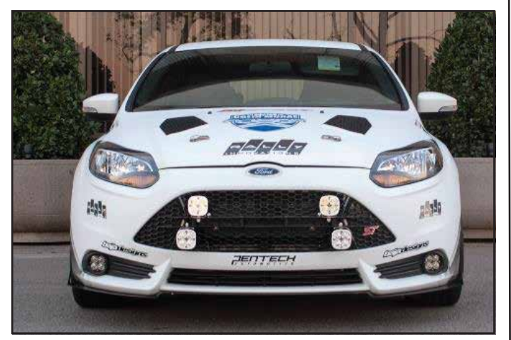
Reinstall front bumper cover. Recommend mount and wiring lights prior to re-installation.