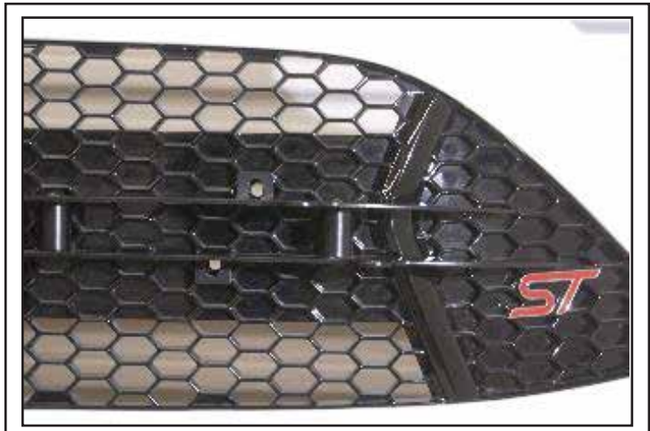
Align light plate to grill as shown above. Take note of lhole locations with respect to grill hexes.