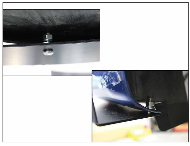
Install 5/16" hardware in the order as follows: Buttonhead bolt, Flat Washer, Split Lock Washer, Hex Nut. Loosely tighten for now.