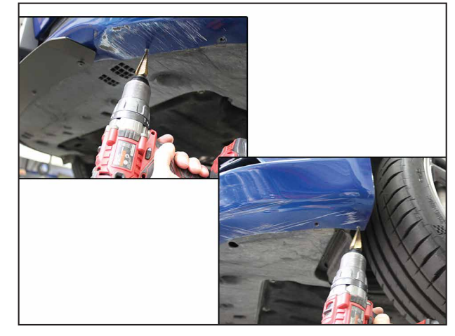
Drill holes out using a step drill bit to 5/16 inch.