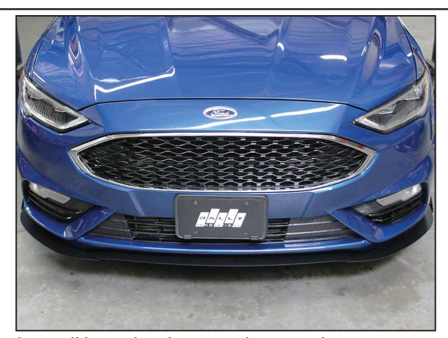
Tighten all loose hardware and review the installation.